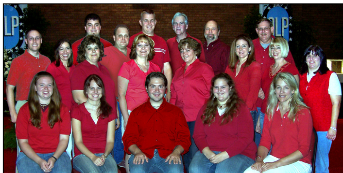
Selah Praise Band

For more information or a sponsorship form, call (814) 882-1333 or e-mail office@peopleforlife.org .